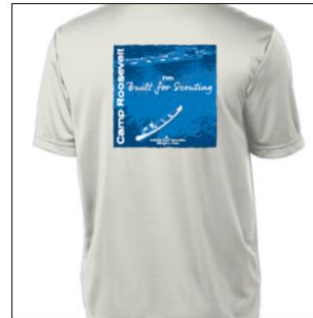
Camp Roosevelt Built for Scouting Canoe T-Shirt $20.00 - $24.00