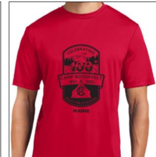
Camp Roosevelt 100th Anniversary T-Shirt Red $20.00 - $24.00