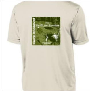
Camp Roosevelt Built for Scouting COPE T-shirt $20.00 - $24.00